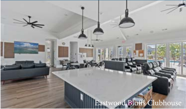
Eastwood Bluffs Clubhouse