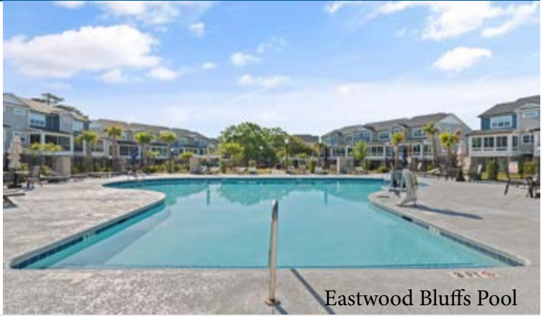
Eastwood Bluffs Pool